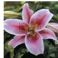
Mona Lisa Rose

Most lily species that we see today are either Asiatic lilies or Oriental lilies: both are the result of extensive hybridization. Because of their complex ancestry, the Asiatic lilies have a never-ending variety of colors, plus a great range of heights and flower forms. One of the most famous and popular, dating from the 1960's, is Lilium 'Enchantment' with its beautiful orange, upward-facing flowers. Another gorgeous upward-facing bloom from this group is Lilium 'Prince Charming'